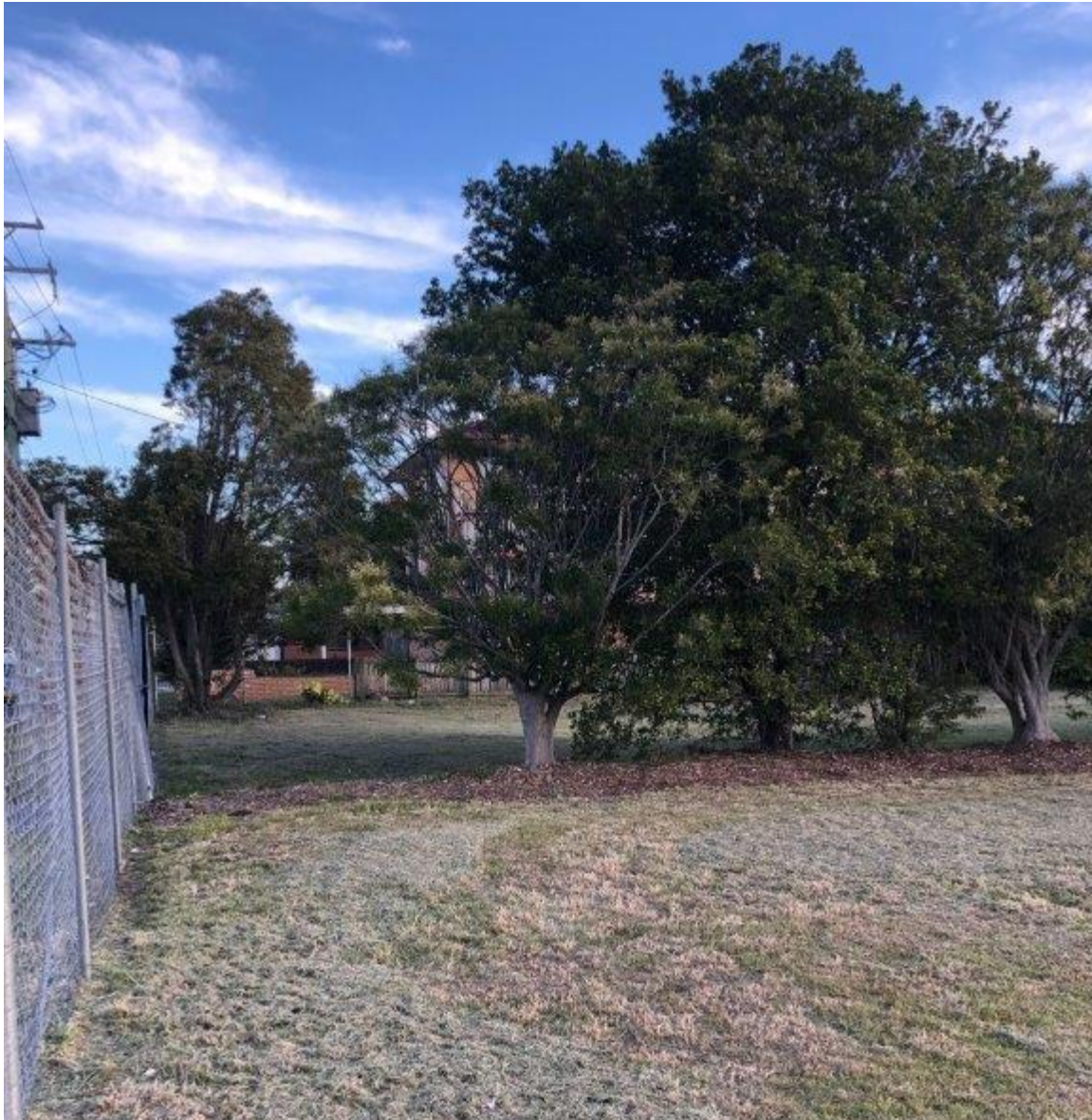
View of site's eastern (front) boundary, looking south