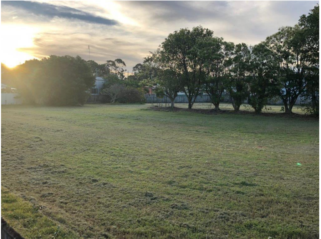
View of site, looking north-west