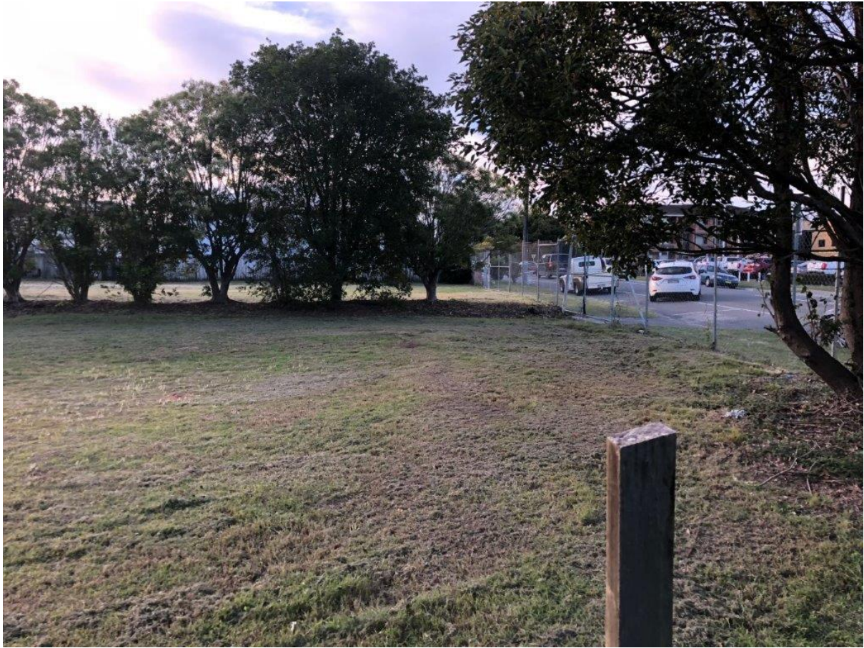
View of site's eastern (front) boundary, looking north-east