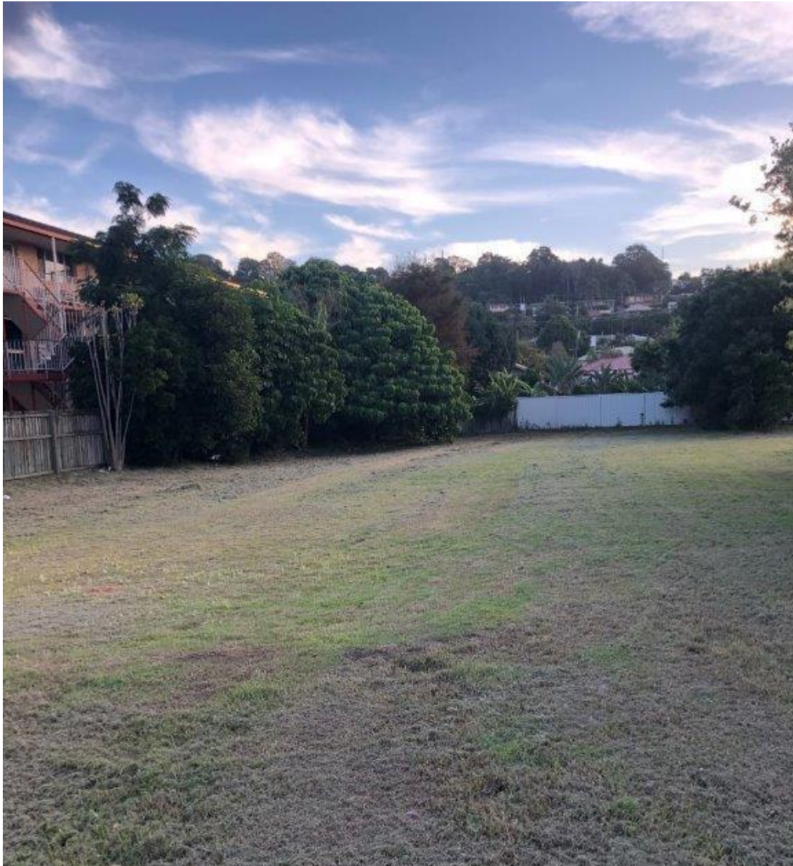
View of site's southern and western (rear) boundaries, looking west