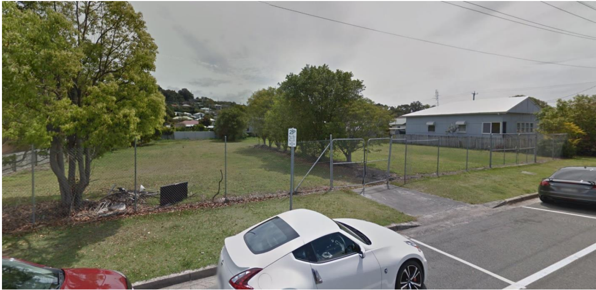
View of site frontage to Boyd Street, looking north-west