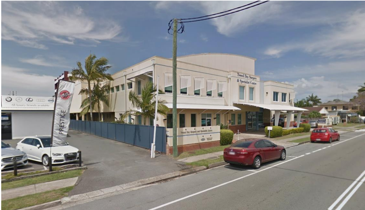
Tweed Day Surgery and Specialist Centre to the south-east of the site on Boyd Street