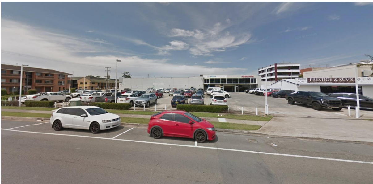
Nissan and Mazda car sales yard directly to the east of the site on Boyd Street