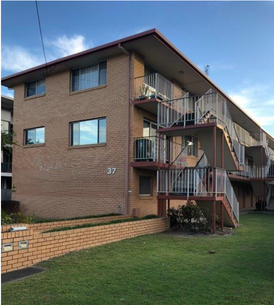
3-storey residential flat building adjoining the site to the south, fronting Boyd Street