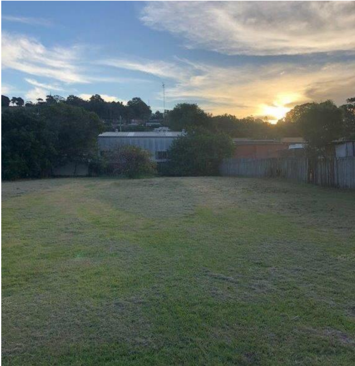
View of site's northern and western (rear) boundaries, looking north-west